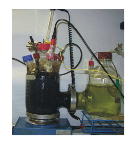
Figure 3: Two-chamber MFC